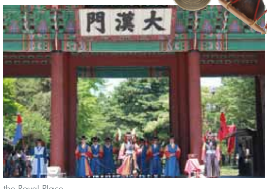
the Royal Place