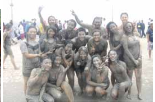
Boryeong Mud Festival