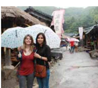
KOFIC Namyangju Studios