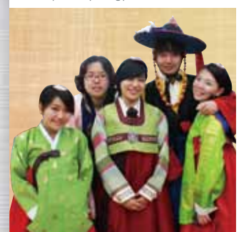
Hanbok (Traditional Korean Costume)